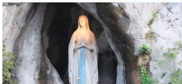
FEBRUARY 11 – FEAST DAY

MARY’S SHELTER PRESENTS...“3RD ANNUAL BE MY VALENTINE!” Next Sunday, February 12, 2023. This event will be held at Our Lady of the Gulf Parish from 12:00-4:00 p.m. Don’t miss this opportunity to support our Moms and Babies at Mary’s Shelter Gulf Coast. Tickets are $100.00 each with a chance to win $10,000.00. Only 500 tickets will be sold. Join us for lunch, silent and live auction and entertainment by the Gulf Coast’s very own Elvis!